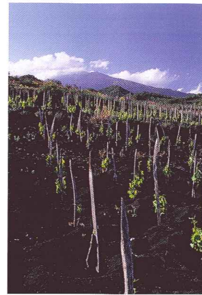
Above: grapes thrive on the mineral-laden slopes of the volcanic Mount Etna

Marc de Grazia's label is Terre Nere (see box, right), and he only vinifies organically farmed Nerello Mascalese, producing various single-vineyard bottlings as well as one from pre-phyllloxera vines. They certainly have the typicity of Nerello Mascalese and are enticingly perfumed, but they can, in some bottlings, show considerable extraction and heat on the palate.