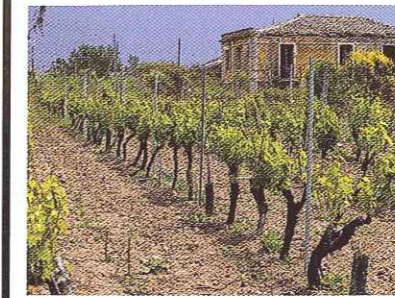
Above: organic plantings in Etna's volcanic soil can yield exciting results

When I received an invitation to taste wines from 50 Etna producers, I found it impossible to resist. Unfortunately half of Sicily felt the same way, and the tasting hall was packed with 2,000 wine enthusiasts, their dogs, babes in pushchairs, and raucous children. Nonetheless, elbow power allowed me to sample some truly remarkable wines.