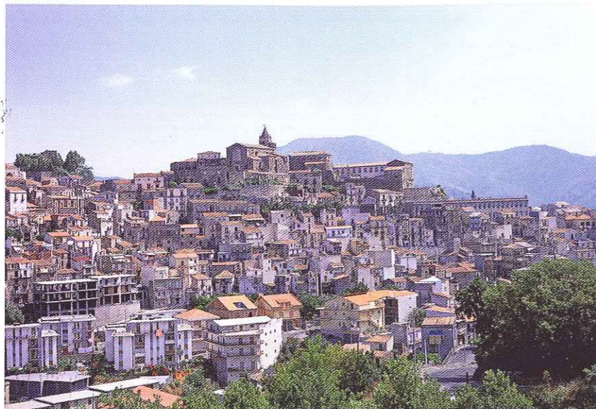
Left: Mount Etna towers over the wine town of Castiglione di Sicilia, just 12km away from the village of Passopisciaro